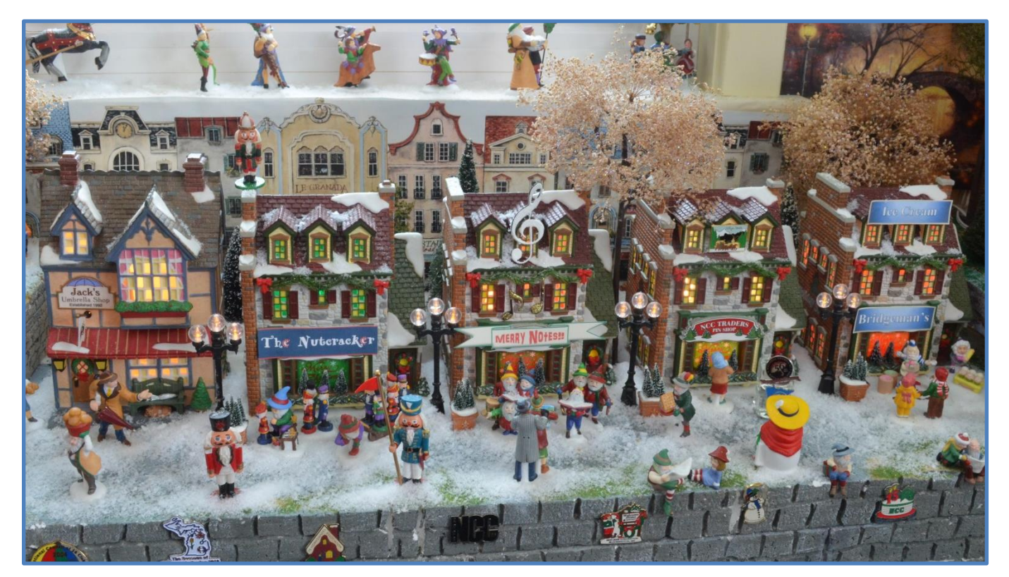
... How about the different look of the identical buildings ; signs and accessories (' Nutcracker De livery' – ' Presenting The Hollymen' /' Sing a Song For Santa' – ' Snowflake, The NCC Snowgirl' – ' The Santa Palooza Masterpiece' ). The inside light bulbs of different colors give a distinct look (through all the windows). Our four ' NCC Traders Pin Shops' become ' The Nutcracker,' ' Merry Makers,' ' NCC Traders Pin Shop,' and ' Bridgeman's.' Note: Immediate background is a wallpaper border. This image appeared in a 2017 <u>JSYK</u>.