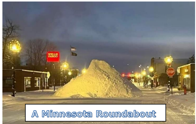
A Minnesota Roundabout