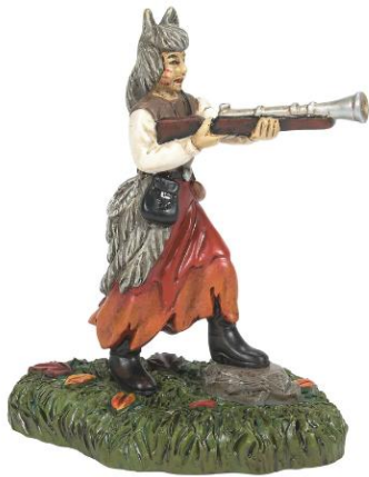
• 'Werewolf Hunter' •