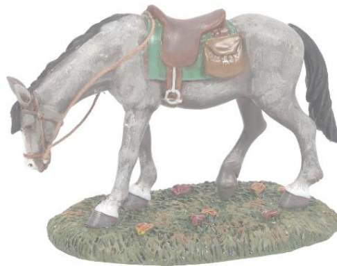
• 'Gunpowder' •