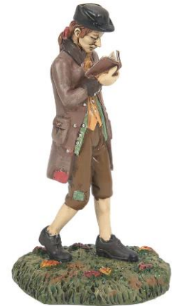
• 'Ichabod Crane' •

... "Is there something never seen before?" from " The Formula for a Successful Village Video " hints by Jim Peters. "Is there something never seen before?" - I like that idea when we welcome visitors to see our village displays.