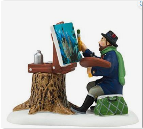
• Above - Dept. 56 Alpine Village 'Plein Air Painter,' 2.24"

. . . "In the open air," I believe, is the definition of 'Plein Air.' I asked myself that question when I discovered Dept. 56 had two pieces using those words. 'Plein Air Painter' in Alpine Village and, in Possible Dreams , Santa is a 'Plein Air Artist.' 10 inches tall (not village size) so no picture needed. Below are the other Dept. 56 'painters' I found - who knew there were that many.