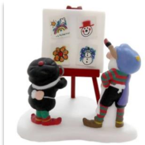
• Department 56, 'Leonardo & Vincent,' North Pole Artists. 2 "H.