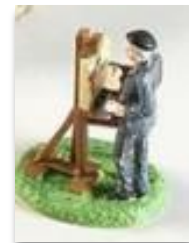
• Department 56, Seasons Bay, accessories of 'Parkside Pavillion.'

. . . I also found other Dept. 56 painters: 'Painting Our Village Sign;' New England Village 'Village Fresh Paint;' NEV, 'Master Sign Painter.'