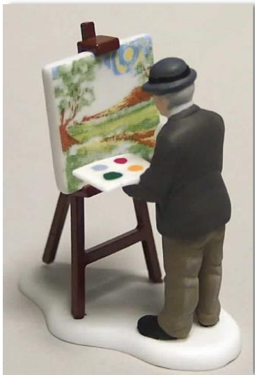
• 'An Artist Touch' - Dept. 56, New England Village.