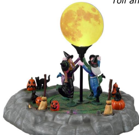
'Dancing In The Moonlight'