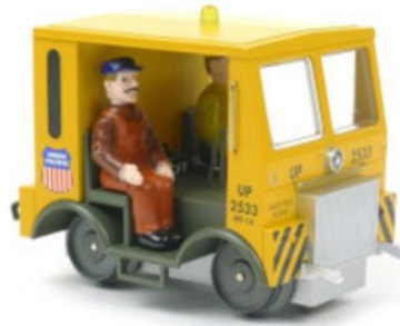
Motorized Speeder with figures, $39.95