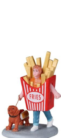
'Halloween Pet Walk'

display for the season, but at the 'Toil and Trouble Ale- name. This Michael's exclu- tures; I also liked the 'look' In The Moonlight.' The ani- hooked up so I can't say any- ment; 'Day of the Dead Par- for 2022 and attracted my it. Looks better in person accessories and figures, Mi- max Halloween pieces. Le- loween' accessory for 2022. I Christmas 'countdown' flip where would we use it.