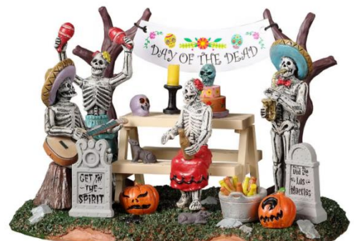
'Day of the Dead Party'