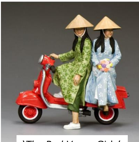
'The Red Vespa Girls'