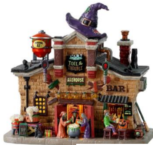
'Toil and Trouble Ale House'