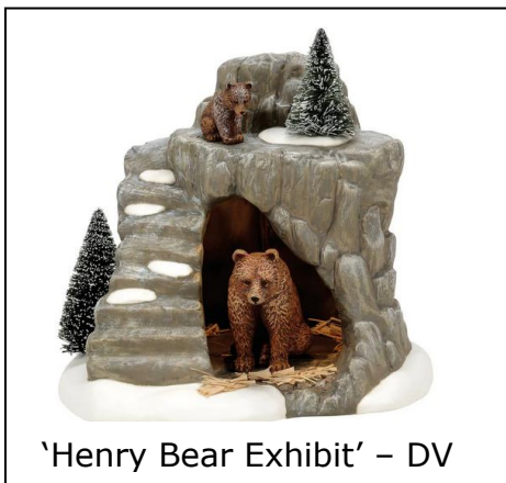
'Henry Bear Exhibit' – DV

. . . 'David's Bookstore' is located in 'Oxfordshire Village,' a Lemax façade. The bookstore has a good name, mine. I'm always interested when that happens. And, I used to read books. (H x W x D), 10.63 x 10.63 x 4.72 inches, rel. 2024, Caddington Village. The ad says "cozy bookstore inviting literary adventurers." Note: remember facades are wonderful background pieces - they are not deep (4.72 in.).