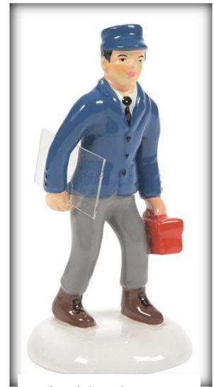
- 'Odd Jobs Before The Snow'

• What do you think, how about using 'Nightwatch' with our, not yet purchased, SV 'Split Rock Lighthouse?' I know he's from Dickens , but I'm still thinking he could check out the shoreline of Lake Superior for us. Hope he doesn't mind being 130 feet above the water. Intro by D56 in Oct. 2022. 2.5 in H x 1 in W x 1.75 in L. We could still use 'Odd Jobs Before the Snow,' the light house accessory. It would be kinda neat (different) to have a worker carrying a piece of replacement glass for the top of the tower. October 2022; 3.35 in H x 1.69 in W x 1.65 in L.