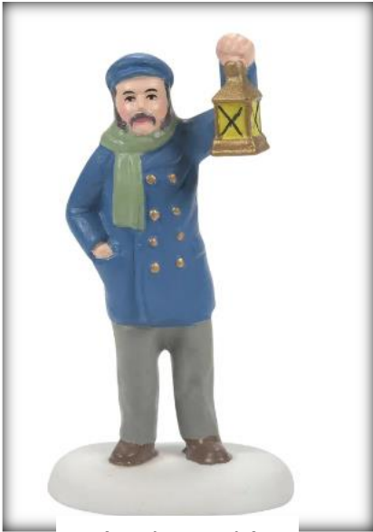
- 'Nightwatch' -

• What do you think, how about using 'Nightwatch' with our, not yet purchased, SV 'Split Rock Lighthouse?' I know he's from Dickens , but I'm still thinking he could check out the shoreline of Lake Superior for us. Hope he doesn't mind being 130 feet above the water. Intro by D56 in Oct. 2022. 2.5 in H x 1 in W x 1.75 in L. We could still use 'Odd Jobs Before the Snow,' the light house accessory. It would be kinda neat (different) to have a worker carrying a piece of replacement glass for the top of the tower. October 2022; 3.35 in H x 1.69 in W x 1.65 in L.